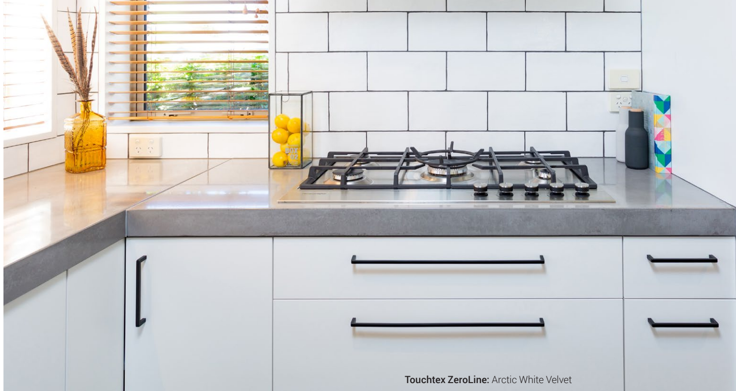
Touchtex ZeroLine: Arctic White Velvet