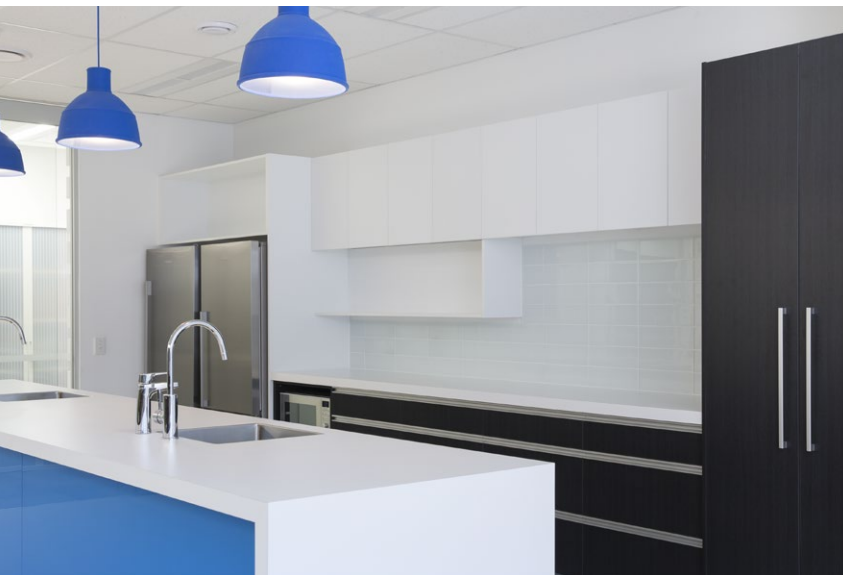
Touchtex: Snowdrift Naturale