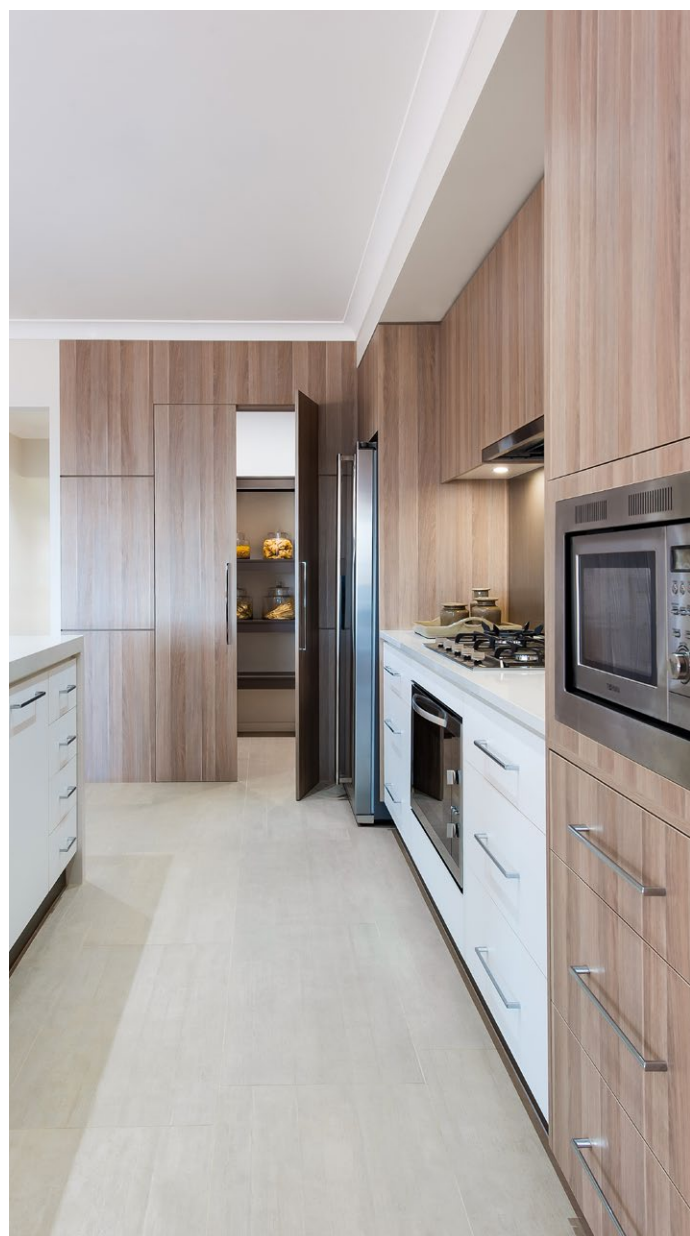
Touchtex ZeroLine: Ptarmigans Wing Matt Touchtex ZeroLine: Rumskulla Oak Matt