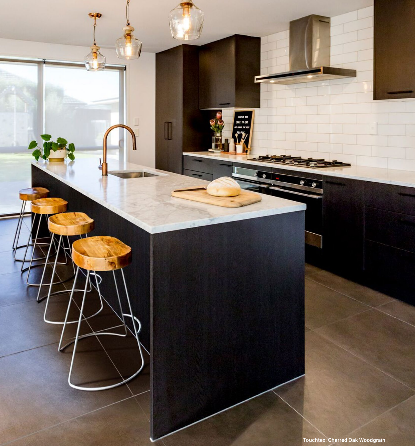
Touchtex: Charred Oak Woodgrain